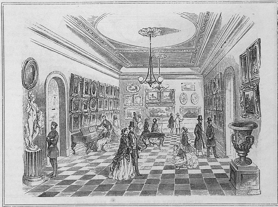
INTERIOR VIEW OF GALLERY—THE CENTRAL ROOM.