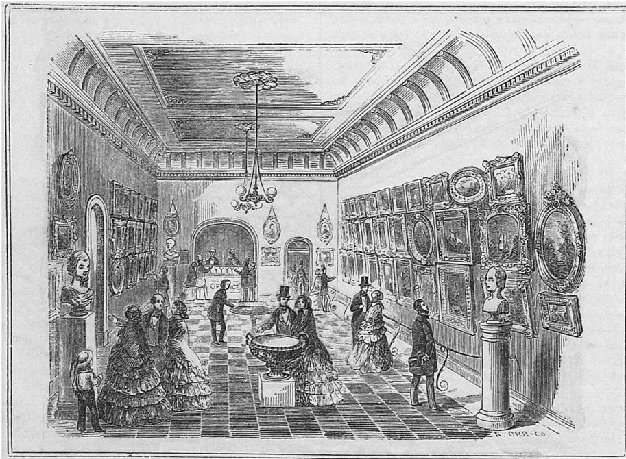
INTERIOR VIEW OF GALLERY—THE EAST ROOM.