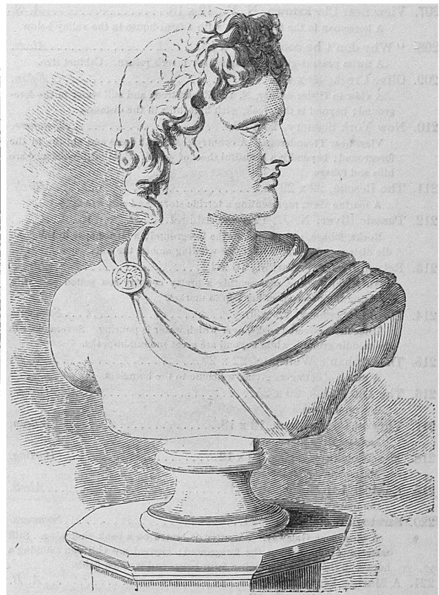
BUST OF APOLLO.