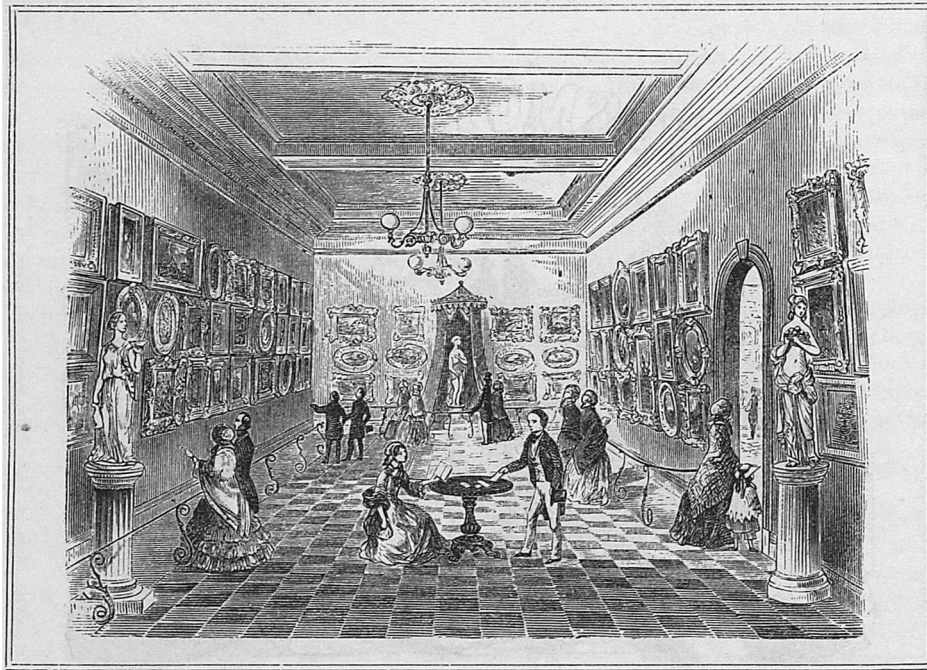
INTERIOR VIEW OF GALLERY—THE WEST ROOM.