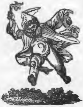
Alter et Idem.